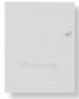
Stainless Steel Cabinet