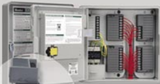
Easy-to-install modules allow you to customize the ICC from 8 to 48 stations.

It's an idea that makes so much sense... while saving you so many dollars. For the professionals who stock and carry controllers, modules make inventory control easy—there's no need to estimate how many of each size controller you need to keep on hand. Now you simply stock modules. And that means, for customers whose systems require a non-standard number of stations, with modules you can customize the controller to the exact needs of the project—even if those needs change as the project grows.