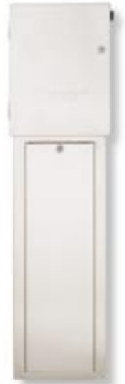
Stainless Steel Pedestal

H unter introduced the concept of personalized construction for controllers—allowing custom tailoring to more effectively handle the odd number of stations a system may require—and the acceptance has been overwhelming. Then again, why shouldn't it be? After all, nothing else makes more sense when seeking the ideal choice to run irrigation systems at virtually any commercial site, from schools, parks, and sports fields to hotels, resorts, and apartment buildings. The idea is a simple one: a controller that's "built" by