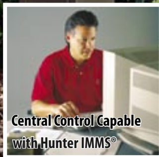
Central Control Capable with Hunter IMMS ®