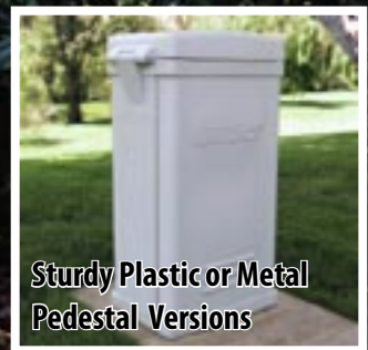
Sturdy Plastic or Metal Pedestal Versions