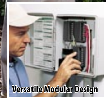
Versatile Modular Design